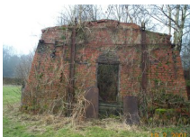
The site in 1960