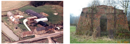
The site in 1960